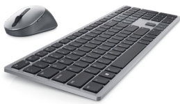
DELL PREMIER MULTI-DEVICE WIRELESS KEYBOARD AND MOUSE – KM7321W

Multi-task seamlessly across 3 devices with this premium full-sized keyboard and sculpted mouse combo with programmable shortcuts and 36 months battery life. 7