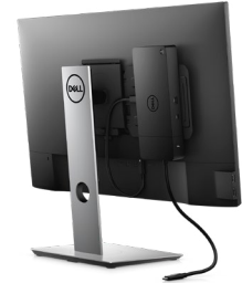
DELL DOCKING STATION MOUNTING KIT – MK15

Experience true color and striking clarity on this 27" 4K monitor with a wide color coverage. This VESA DisplayHDR™ 400 monitor features virtually borderless InfinityEdge and USB-C connectivity with up to 90W power delivery.