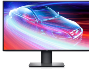
DELL ULTRASHARP 27 4K USB-C MONITOR – U2720Q

Multi-task seamlessly across 3 devices with this premium full-sized keyboard and sculpted mouse combo with programmable shortcuts and 36 months battery life. 7