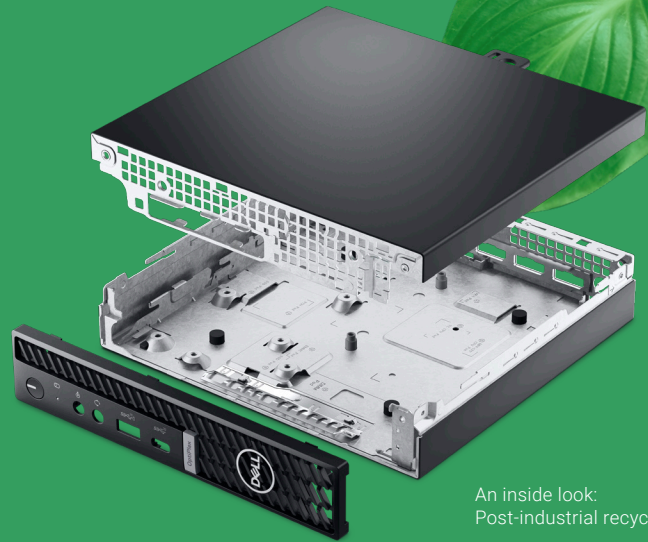
An inside look: Post-industrial recycled steel

OptiPlex is passionate about reducing our products' carbon footprint and helping our customers make an impact on the future. And its why Micro is now the most energy efficient ultracompact commercial PC 1 . We take a circular design approach – innovating with renewable materials, packaging, energy conservation, recycling and even repairability.