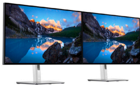
(2) Dell UltraSharp 27 4K Monitors - U2723QE

Be your most productive on a 27 inch monitor with brilliant color and contrast that features the industry's first IPS Black technology and a connectivity hub.