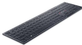
Dell Premier Collaboration Keyboard and Mouse – KM900

Be your most productive on a 27 inch monitor with brilliant color and contrast that features the industry's first IPS Black technology and a connectivity hub.